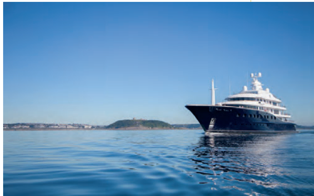
2016 Aquila departs Falmouth

In the following years Pendennis launched numerous milestone refit and restoration projects, recognised internationally at prestigious awards ceremonies. MY Malahne , the 1938 Camper & Nicholsons classic motor yacht, undertook an extensive restoration and was named "Best Rebuild" at the 2015 World Superyacht Awards (WSAs). In 2015 MY Aquila , the 2005 American-built 86m motor yacht, became the largest yacht yet to be refitted at Pendennis. Her new Owners embarked upon an ambitious redesign and were rewarded with "Best Refit" at the 2016 WSAs and "Refitted Yacht" at the International Superyacht Society Awards in 2017. As well as continuing to complete these large-scale transformations,