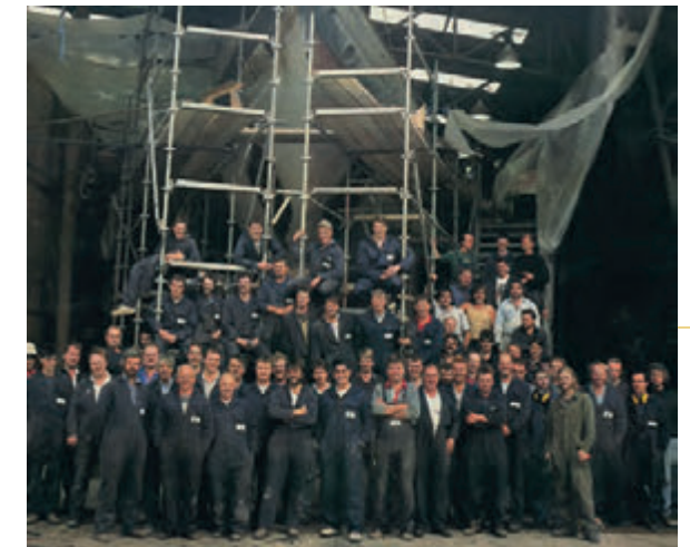
1994 The Pennennis team with SY Adela