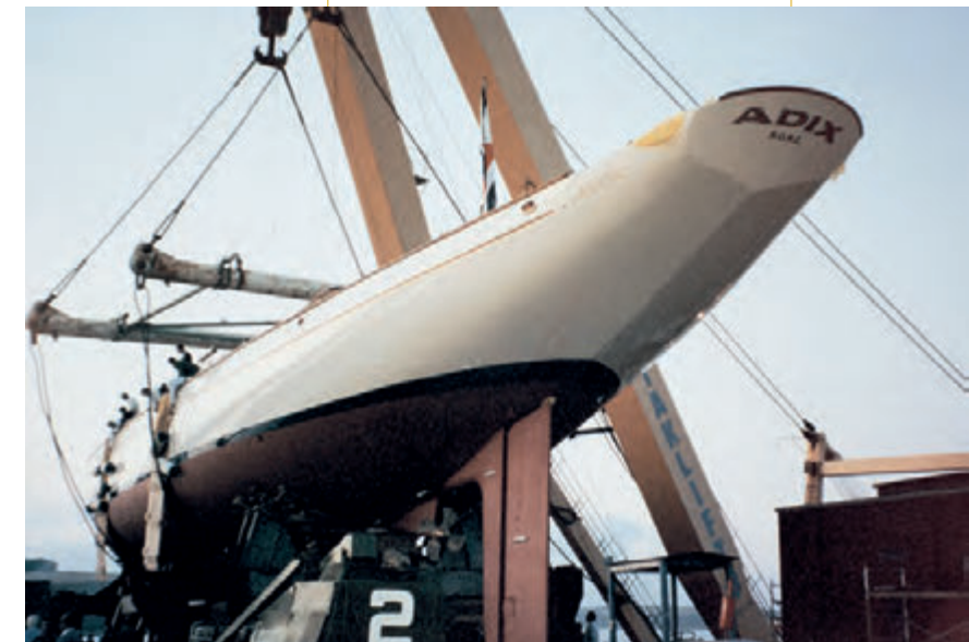
1990 Adix's first refit at Pennennis