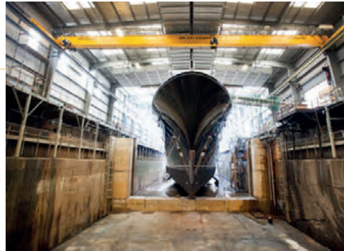
2016 Aquila becomes the largest yacht to be refitted at Pendennis and is awarded multiple industry accolades