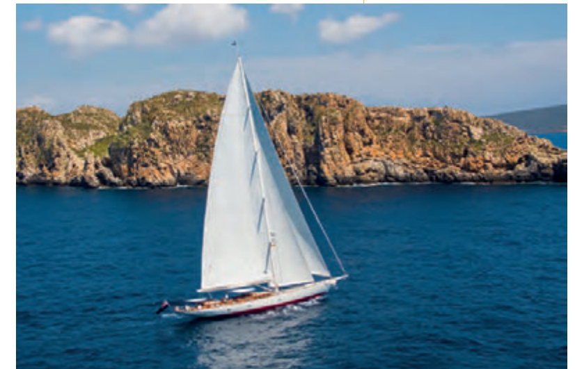
2018 128ft custom built Hoek sloop Vijonara is delivered