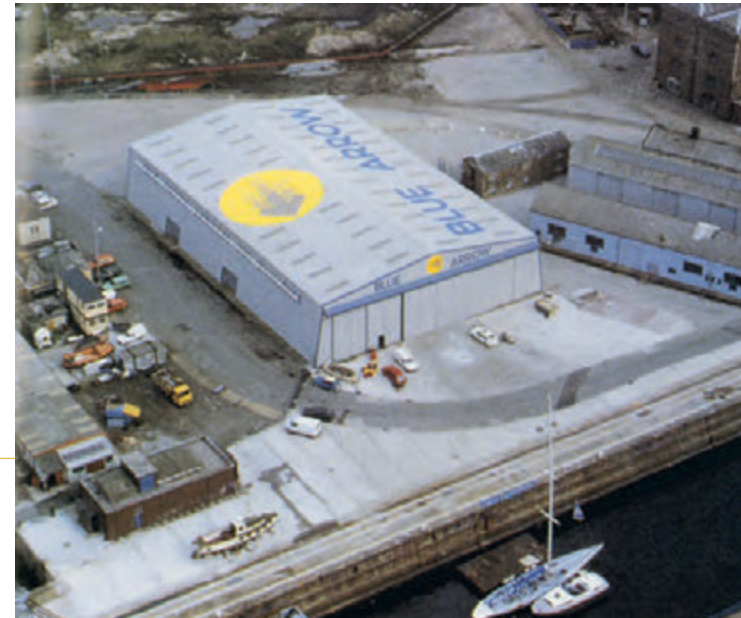
1988 Pennennis Shipyard's beginnings

The period between 1995 and 1999 was a very successful one for Pennennis; the shipyard won a multitude of awards and was cruising comfortably through a period of expansion and diversification. In 1998, the apprenticeship scheme was launched when the first ten apprentices were taken on to train to become skilled craftspeople. In 1999 Pennennis launched Ilona (now Ilonka), the first luxury motor yacht to be built by Pennennis.