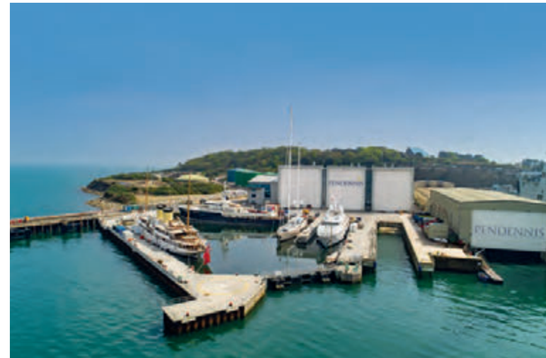
2017 Pendennis' enhanced facilities and non tidal basin