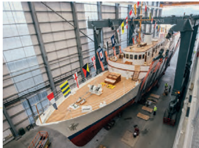
2015 Malahne launches and wins World Superyacht Award for Rebuilt Yacht